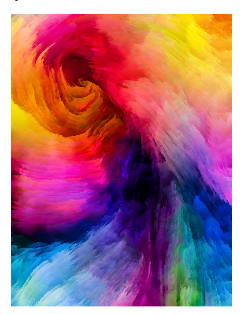
Grace: The Uncontrolling Love of God

Black Lives Matter / Welcome the Stranger, including Migrants and Refugees Stop Hate Against Muslims, Jews, Asian Americans, and Pacific Islanders