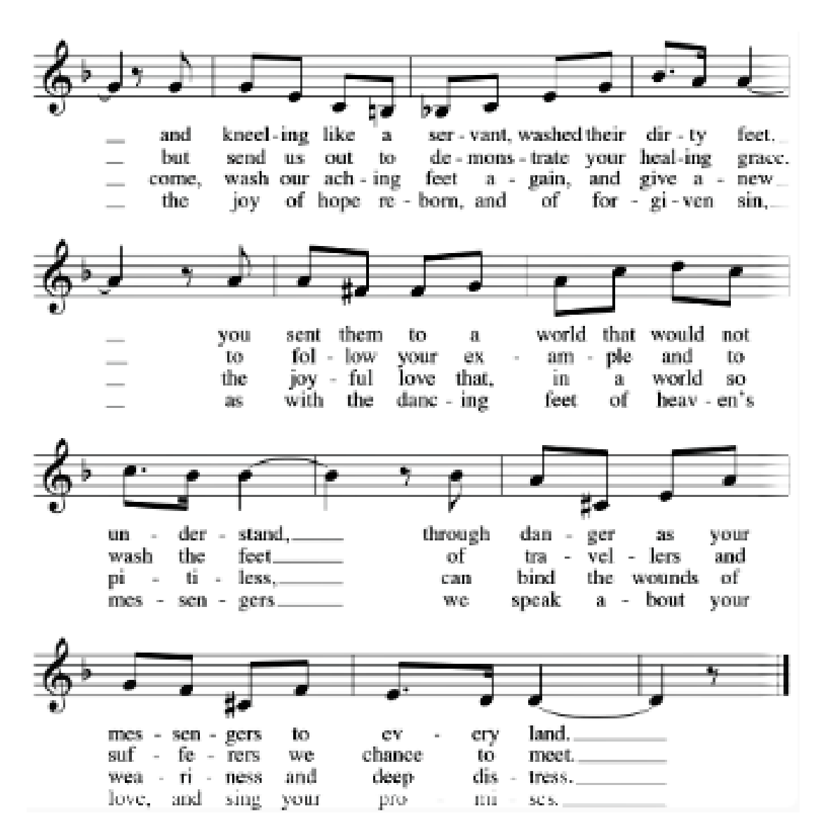
Lavapé (El lavado de los pies)