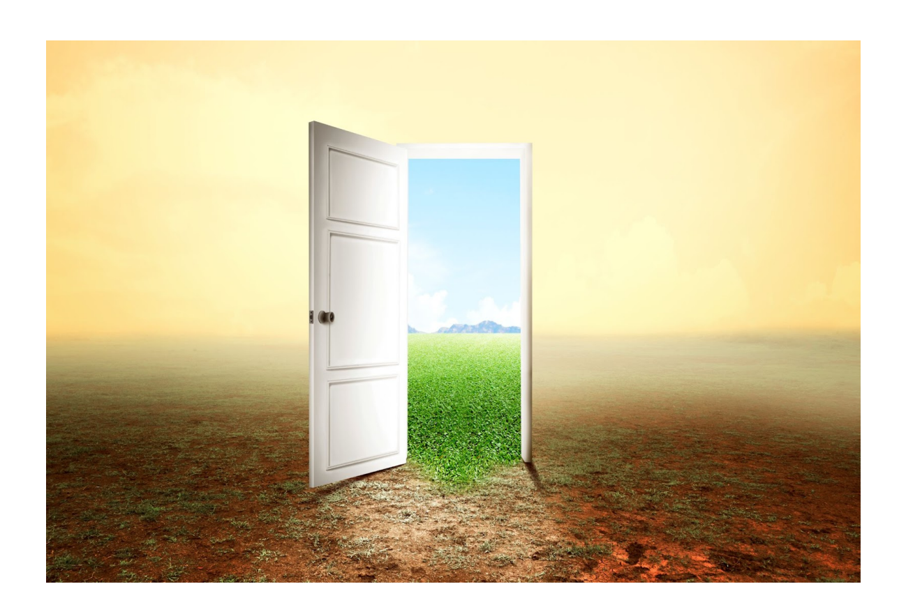
The Gift of Doubt

Black Lives Matter / Welcome the Stranger, including Migrants and Refugees Stop Hate Against Muslims, Jews, Asian Americans, and Pacific Islanders