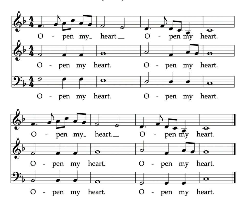
Open My Heart