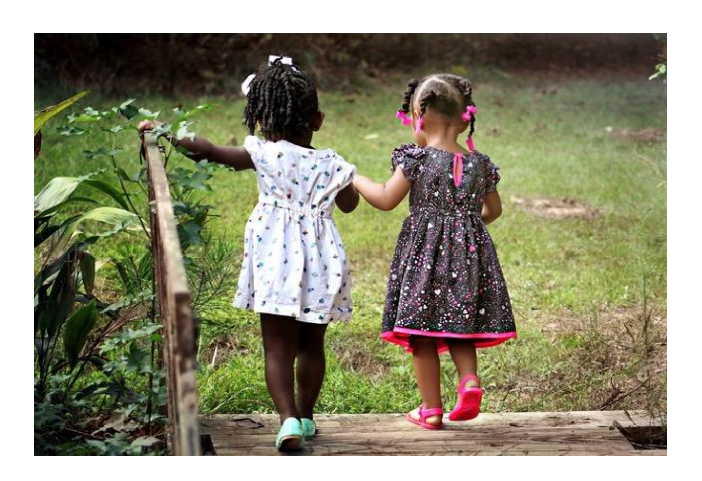
Ubuntu: Encouragement, Accountability, and Grace

Celebrating LGBTQ+ History Month Black Lives Matter / Welcome the Stranger, including Migrants and Refugees Stop Hate Against Muslims, Jews, Asian Americans, and Pacific Islanders