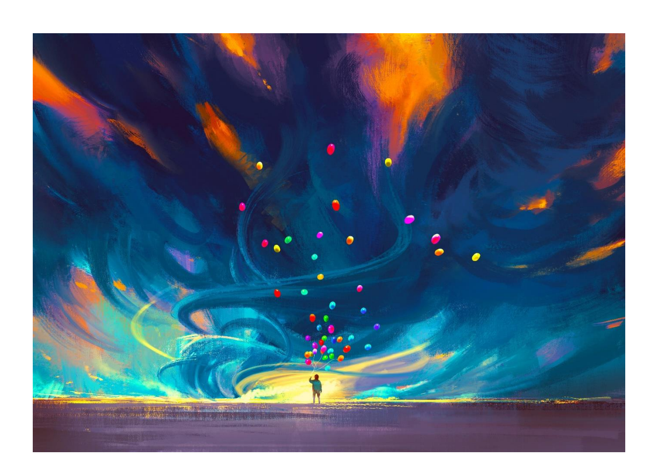
Prayer as Opening

Honor the Earth / Black Lives Matter No Human Being Is "Illegal" / No Muslim Ban Ever Stop Hate Against Asian Americans and Pacific Islanders