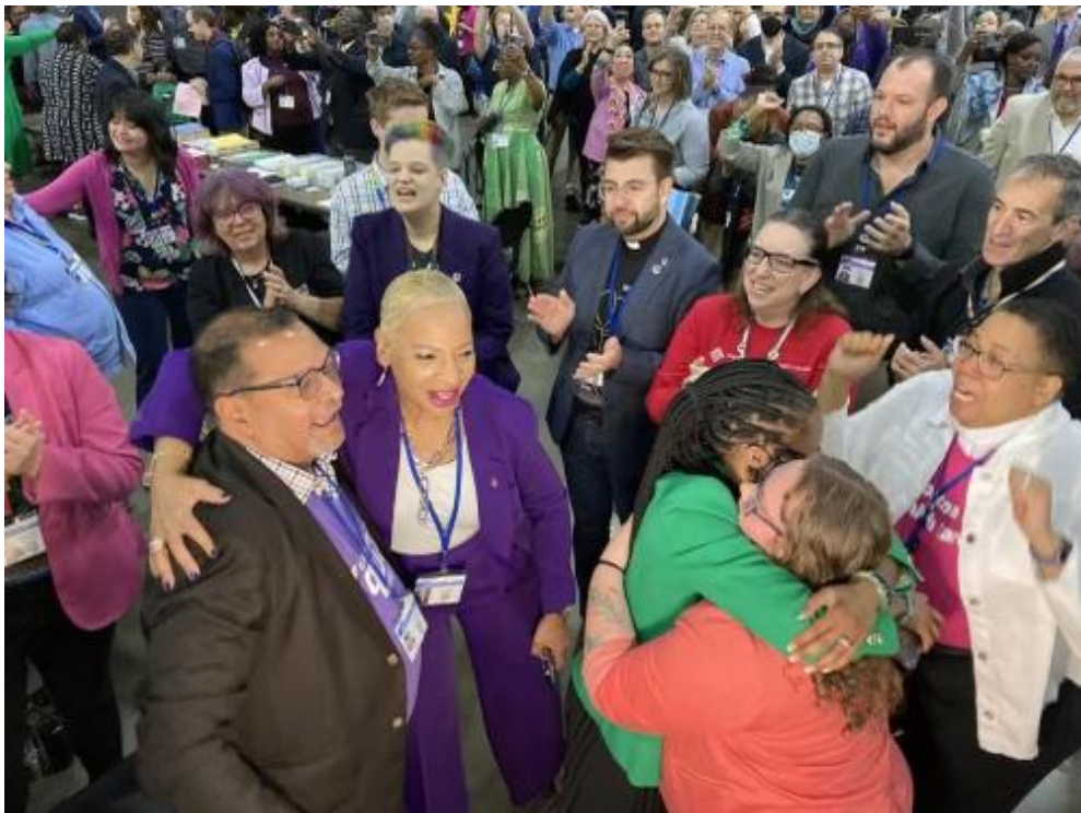
Wednesday, May 1: Joyful celebration following an overwhelming vote to remove a Book of Discipline prohibition on performing same-sex weddings in UM churches or by UM pastors.

Black Lives Matter / Welcome the Stranger, including Migrants and Refugees Stop Hate Against Muslims, Jews, Asian Americans, and Pacific Islanders